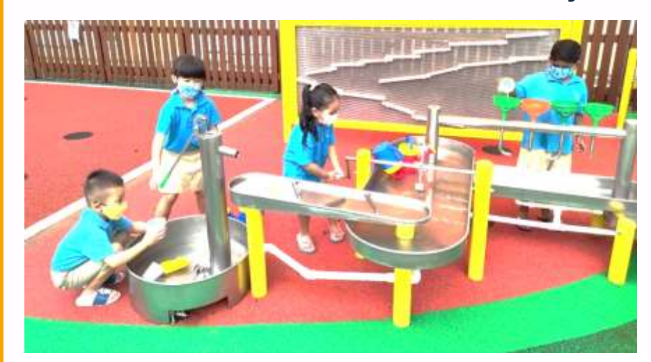
Water play and sand play features that encourage children to be little investigators

Carefully designed to provide a variety of play experiences